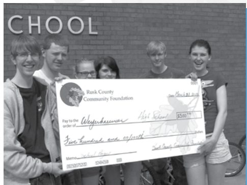
Weyerhaeuser High School Outsiders Group - $500. Charting, mapping, and creating a brochure of unique areas of the Blue Hills.