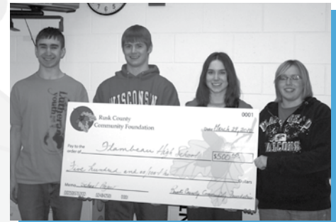
Flambeau High School AODA Group - $500. Creating and filming a commercial to support the prevention of underage drinking.