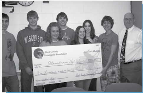
Flambeau High School Emergency Responders - $500. Training for school Emergency Team